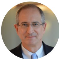
Brian L. Roberts Comcast Corporation Chairman & CEO (/about-us/members/brian- l-roberts-chairman-ceo-