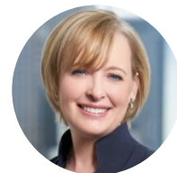
Julie Sweet Accenture Chief Executive Officer – North America (/julie-sweet-chief-executive-officer-north-america-accenture)