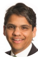
Francisco D'Souza Cognizant Technology Solutions Chief Executive Officer (/about- us/members/francisco- dsouza-chief-executive- officer-cognizant- technology-solutions)