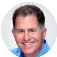
Michael Dell Dell Technologies Inc. Chairman and Chief Executive Officer (/about- us/members/michael-dell- chairman-and-chief- executive-officer-dell- technologies-inc).