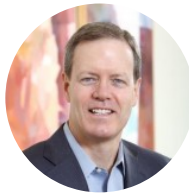
Mike Roman 3M CEO (/mike-roman-ceo-3m)