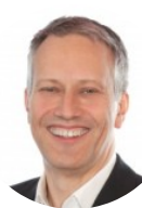
James Quincey The Coca-Cola Company President & CEO (/about-us/members/james- quincey-president-ceo-the- coca-cola-company)