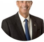
Mike Wirth Chevron Corporation Chairman of the Board and Chief Executive Officer (/mike-wirth-chairman-of- the-board-and-chief- executive-officer-chevron- corporation)