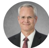
Darren W. Woods ExxonMobil Chairman & Chief Executive Officer (/about-us/members/darren-w-woods-chairman-chief-executive-officer-exxonmobil)