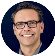
James Murdoch 21st Century Fox Chief Executive Officer (/about-us/members/james-murdoch-chief-executive-officer-21st-century-fox)