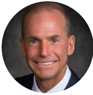
Dennis A. Muilenburg The Boeing Company Chairman, President and Chief Executive Officer (/about- us/members/dennis-a- muilenburg-chairman- president-and-chief- executive-officer-the-boeing- company).