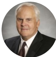
Frederick W. Smith FedEx Corporation Chairman & CEO (/about-us/members/frederick-w-smith-chairman-ceo-fedex-corporation)