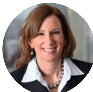
Catherine M. Engelbert Deloitte US Chief Executive Officer (/about- us/members/catherine-m- engelbert-chief-executive- officer-deloitte-us).