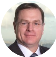
Gregory C. Case Aon President and Chief Executive Officer (/about- us/members/gregory-c-case- president-and-chief- executive-officer-aon)