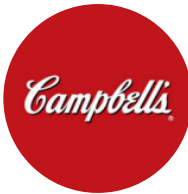
Campbell Soup Company (/campbell-soup-company).