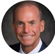
Dennis A. Muilenburg

(/about-us/members/larry-j-merlo-president-and-chief-executive-officer-cvs-health)