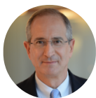
Brian L. Roberts Comcast Corporation Chairman & CEO (/about-us/members/brian-l-roberts-chairman-ceo-comcast-corporation)