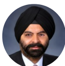
Ajay Banga Mastercard President & CEO (/about-us/members/ajay-banga-president-ceo-mastercard)