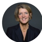
Beth Ford Land O'Lakes President and Chief Executive Officer (/beth-ford-president- and-chief-executive- officer-land-olakes)