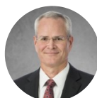
Darren W. Woods ExxonMobil Chairman & Chief Executive Officer (/about- us/members/darren- w-woods-chairman- chief-executive- officer-exxonmobil)