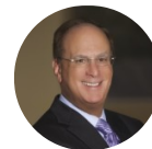
Laurence D. Fink BlackRock, Inc. Chairman and Chief Executive Officer (/about-us/members/laurence-d-fink-chairman-and-chief-executive-officer-blackrock-inc)