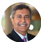
Sanjay Mehrotra Micron Technology, Inc. President and Chief Executive Officer (/sanjay-mehrotra- president-and-chief- executive-officer- micron-technology- inc)