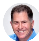
Michael Dell Dell Technologies Inc. Chairman and Chief Executive Officer (/about-us/members/michael-dell-chairman-and-chief-executive-officer-dell-technologies-inc)