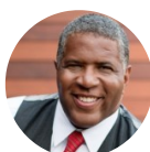
Robert F. Smith Vista Equity Partners Founder, Chairman and CEO (/about-us/members/robert-f-smith-founder-chairman-and-ceo-vista-equity-partners)