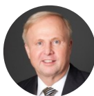
Robert (Bob) Dudley BP p.l.c. Group Chief Executive (/about-us/members/robert-bob-dudley-group-chief-executive-bp-plc)