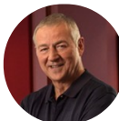
Dr. James Goodnight SAS Chairman, President & CEO (/about-us/members/dr-james-goodnight-chairman-president-ceo-sas)