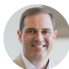
Chuck Robbins Cisco Systems, Inc. Chairman and Chief Executive Officer (/about- us/members/chuck- robbins-chairman- and-chief-executive- officer-cisco-systems- inc)