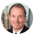
James P. Gorman Morgan Stanley Chairman and Chief Executive Officer (/about- us/members/james-p- gorman-chairman- and-chief-executive- officer-morgan- stanley)