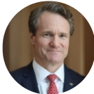
Brian T. Moynihan Bank of America Corporation Chairman of the Board and Chief Executive Officer (/about-us/members/brian-t-moynihan-chairman-of-the-board-and-chief-executive-officer-bank-of-america-corporation)