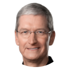
Tim Cook Apple, Inc. CEO