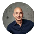
Jeff Bezos Amazon Founder, Chairman, CEO and President (/jeff-bezos-founder-chairman-ceo-and-president-amazon)