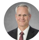
Darren W. Woods ExxonMobil Chairman & Chief Executive Officer (/about-us/members/darren-w-woods-chairman-chief-executive-officer-exxonmobil)