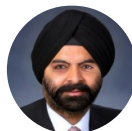
Ajay Banga Mastercard President & CEO (/about- us/members/ajay-