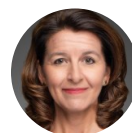
Kathy Warden Northrop Grumman Corporation Chairman, Chief Executive Officer and President (/kathy-warden-chairman-chief-executive-officer-and-president-northrop-grumman-corporation).