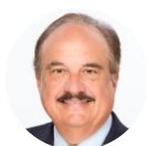
Larry J. Merlo CVS Health President and Chief Executive Officer (/about- us/members/larry-j- merlo-president-and- chief-executive- officer-cvs-health)