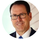
Randall Stephenson AT&T Inc. Chairman and Chief Executive Officer (/about-us/members/randall-stephenson-chairman-and-chief-executive-officer-att-inc)