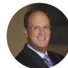
Laurence D. Fink BlackRock, Inc. Chairman and Chief Executive Officer (/about-us/members/laurence-d-fink-chairman-and-chief-executive-officer-blackrock-inc)