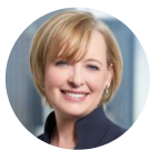
Julie Sweet Accenture Chief Executive Officer – North America