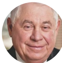
Richard C. Adkerson Freeport-McMoRan Inc. Vice Chairman, President and Chief Executive Officer (/about-us/members/richard-c-adkerson-vice-chairman-president-and-chief-executive-officer-freeport-mcmoran-inc)