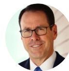
Randall Stephenson AT&T Inc. Chairman and Chief Executive Officer (/about- us/members/randall- stephenson-chairman- and-chief-executive- officer-att-inc).