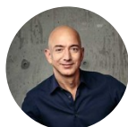
Jeff Bezos Amazon Founder, Chairman, CEO and President

(/jeff-bezos-founder-chairman-ceo-and-president-amazon).