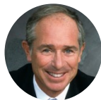
Stephen A. Schwarzman Blackstone Chairman, Chief Executive Officer and Co-Founder (/about- us/members/stephen- a-schwarzman- chairman-chief- executive-officer-and- co-founder).