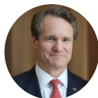
Brian T. Moynihan Bank of America Corporation Chairman of the Board and Chief Executive Officer (/about- us/members/brian-t- moynihan-chairman- of-the-board-and- chief-executive- officer-bank-of- america-corporation).