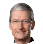
Tim Cook Apple, Inc. CEO (/about- us/members/tim- cook-ceo-apple-inc).