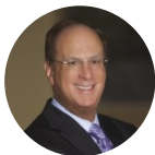
Laurence D. Fink BlackRock, Inc. Chairman and Chief Executive Officer (/about- us/members/laurence- d-fink-chairman-and- chief-executive- officer-blackrock-inc).